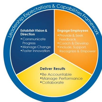
Figure 2 – Leadership Expectations & Capabilities Framework