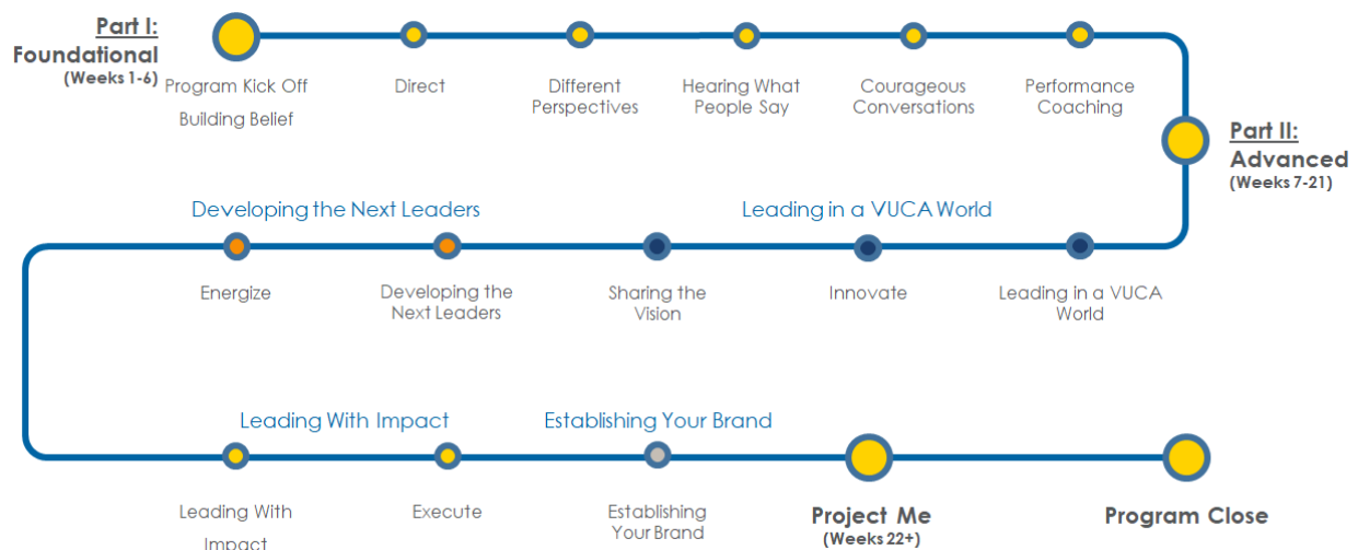
Figure 3 – Leadership Success Program for Senior Leaders journey map

There are two main parts to the synchronous learning portion of the program. The first part provides a baseline of core capabilities and mindsets that participants will need to effectively lead supervisors, managers, and senior individual contributors under them. The second part dives into each of the leadership expectations for this level of leader.