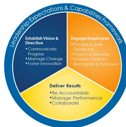
Figure 2 – Leadership Expectations & Capabilities Framework